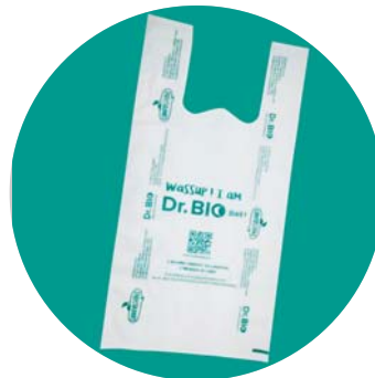
Shopping / Carry Bags