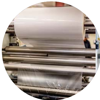
Cast & Lamination