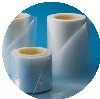
Paper Like Films