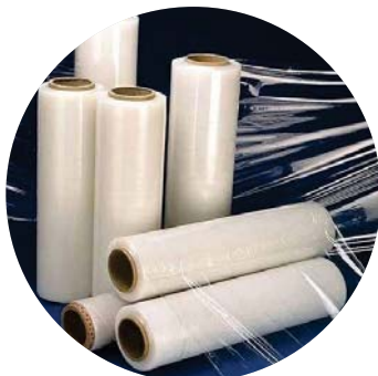
Shrink & Stretch Films