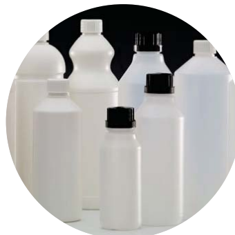
Bottles & Containers