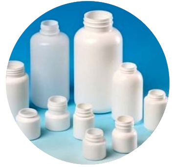
Injection & Blown Moulding