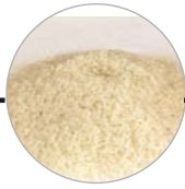
Dr. Bio Polymers