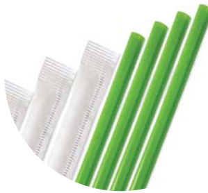
Pipes & Straws