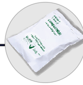
Dr. Bio Products